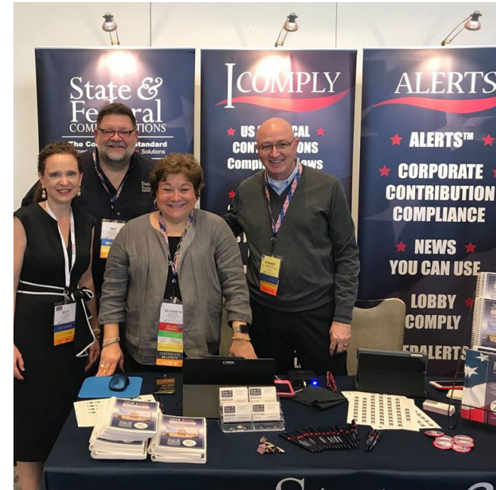
State and Federal Communications booth